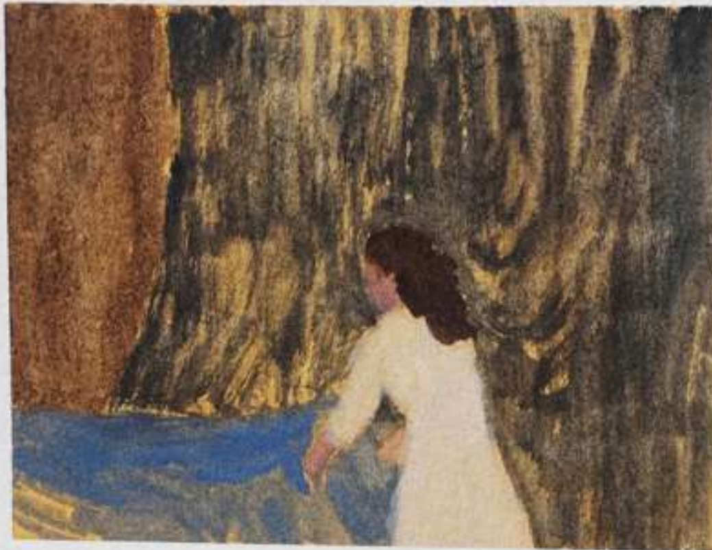
Making the Bed Watercolour on paper 7x5.3cm Bobbye Fermie