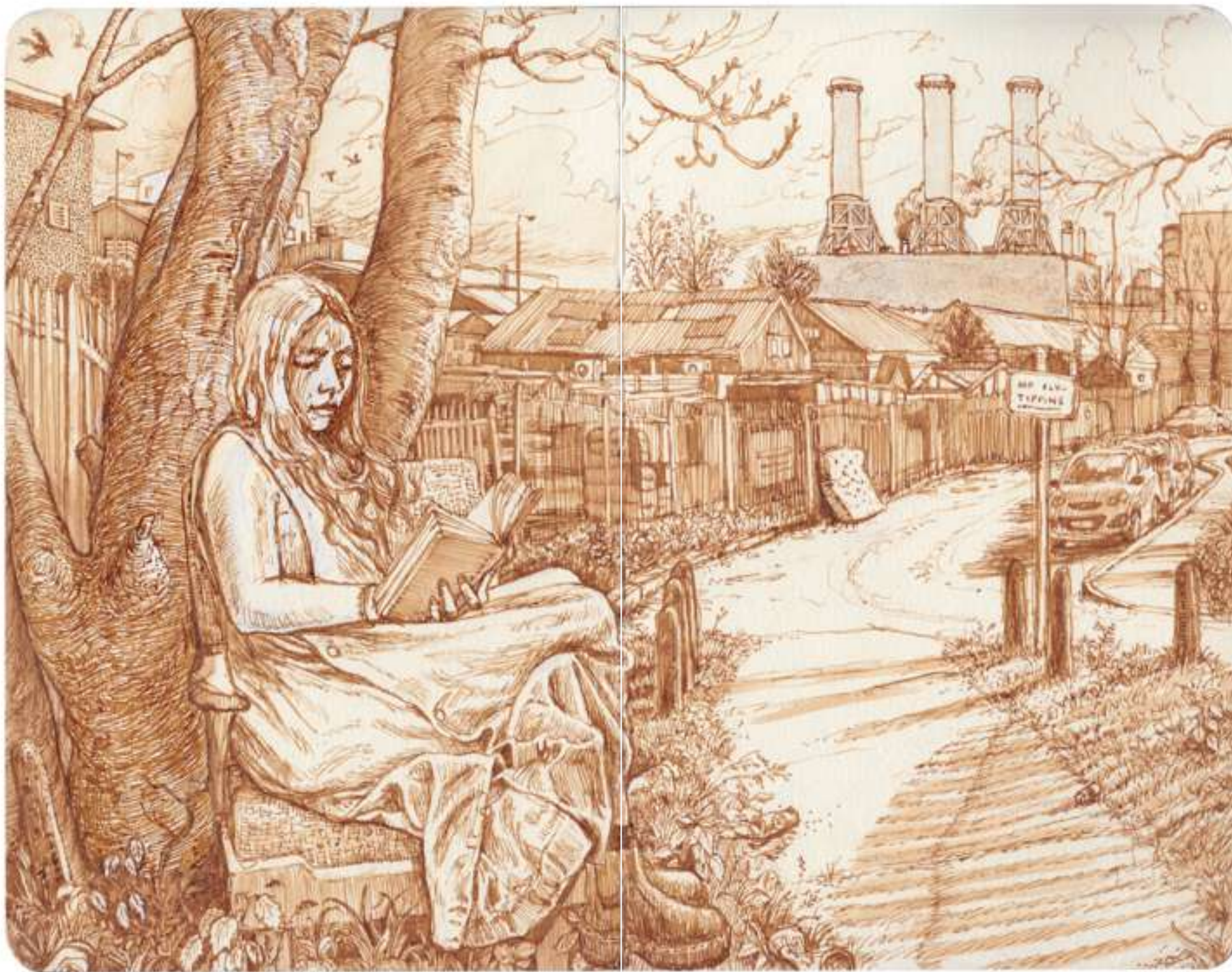
The End of Farm Lane