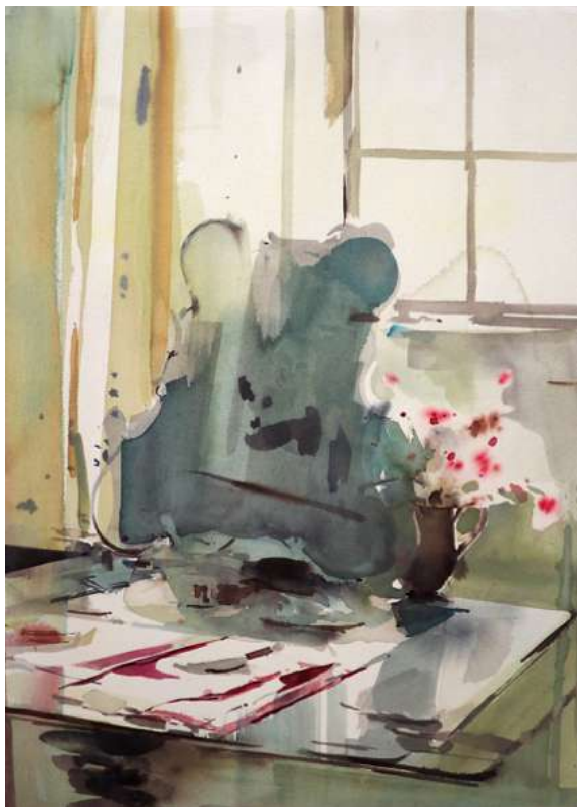
Shifting Clarities Watercolour on paper 71x51cm Eleanor Watson