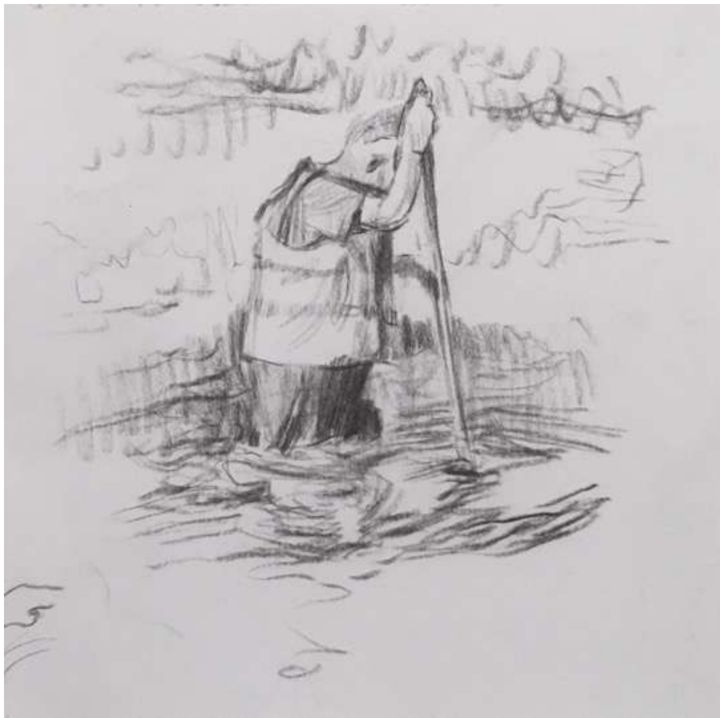
Cardiff Rivers Group Study (Wader) Charcoal on Paper 20 x 20cm (Aprox) Geraint Ross Evans