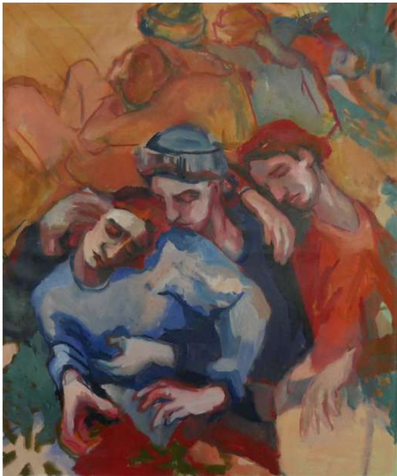
Huddle Oil on Canvas 100x120cm Rachel Mercer