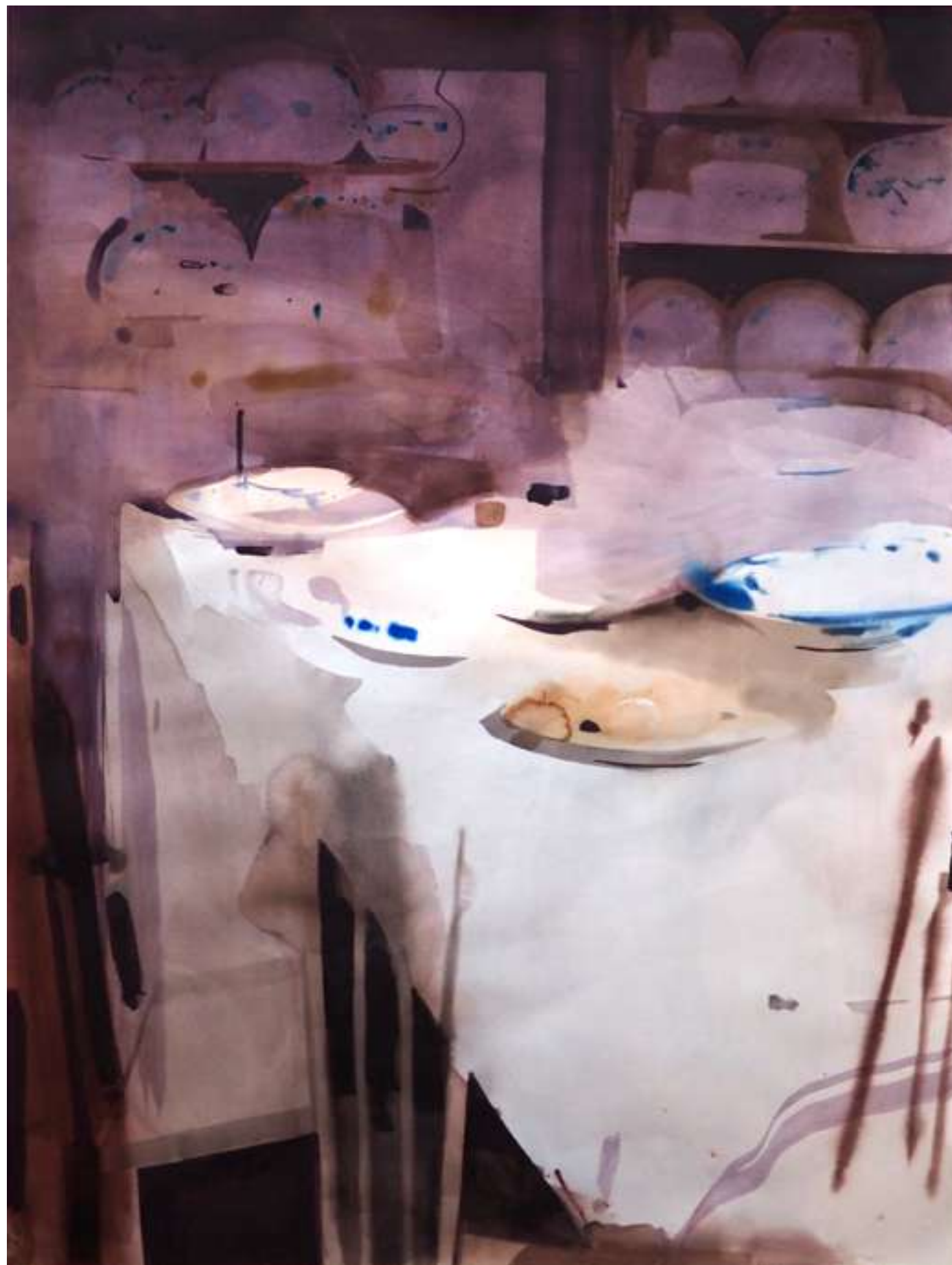
The Doors No Longer Hang True 2 Watercolour and gouache on paper 148x111cm Eleanor Watson