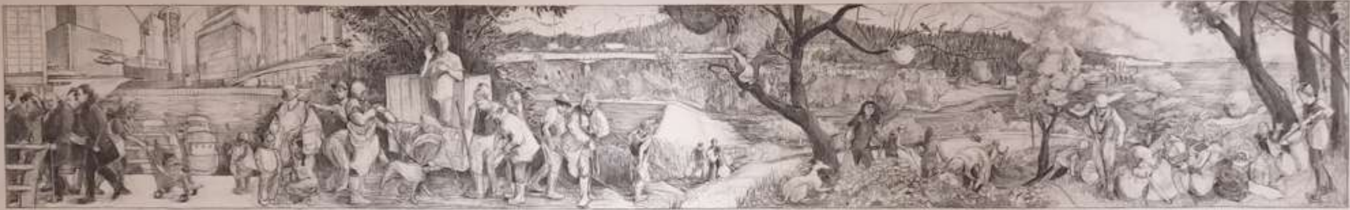
The Closer We Are Charcoal on Paper 48x366cm Geraint Ross Evans £2500