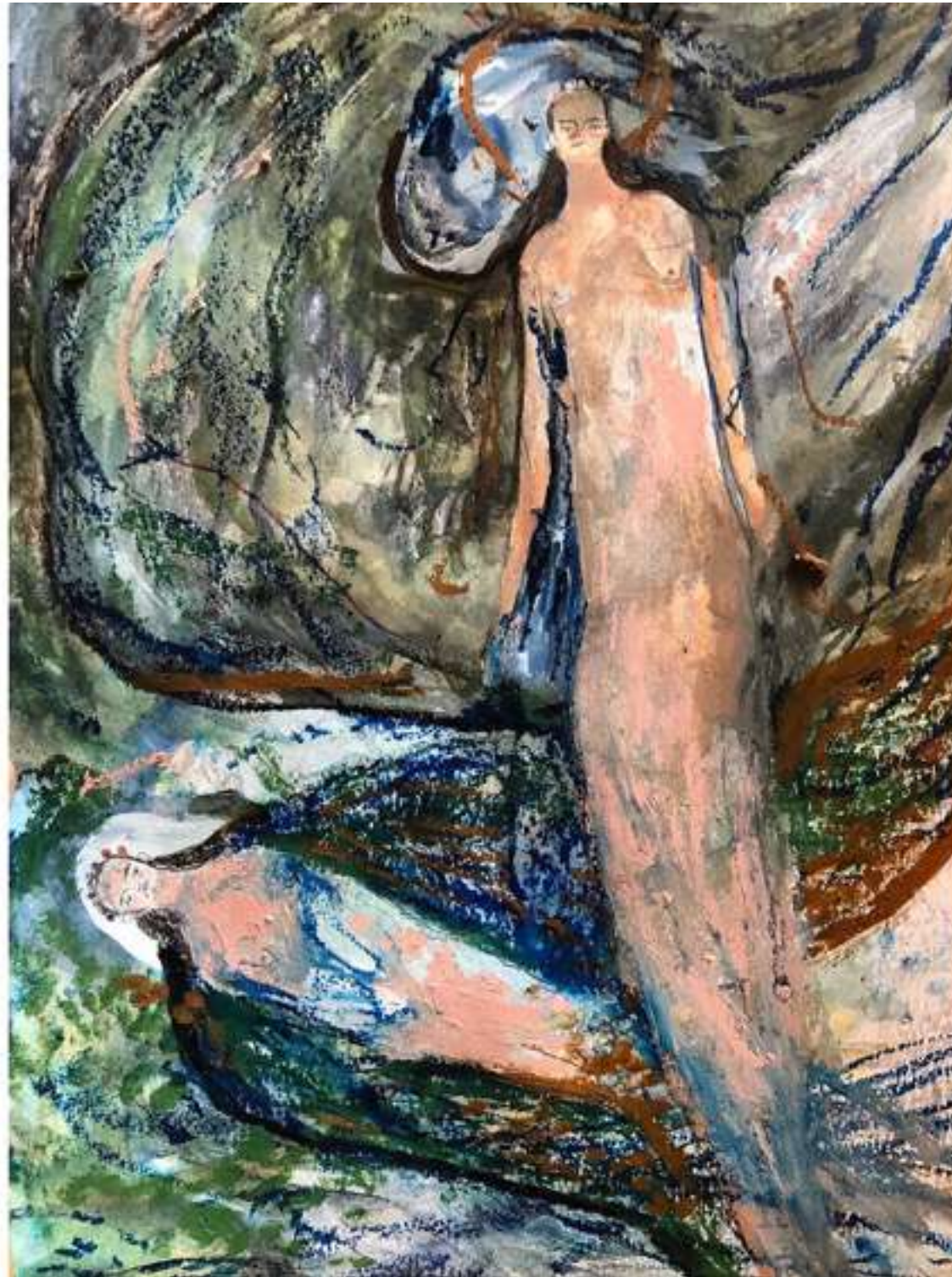
Where do Angels go when they die? Acrylic, watercolour and crayon on paper 21x29cm Melissa Kime