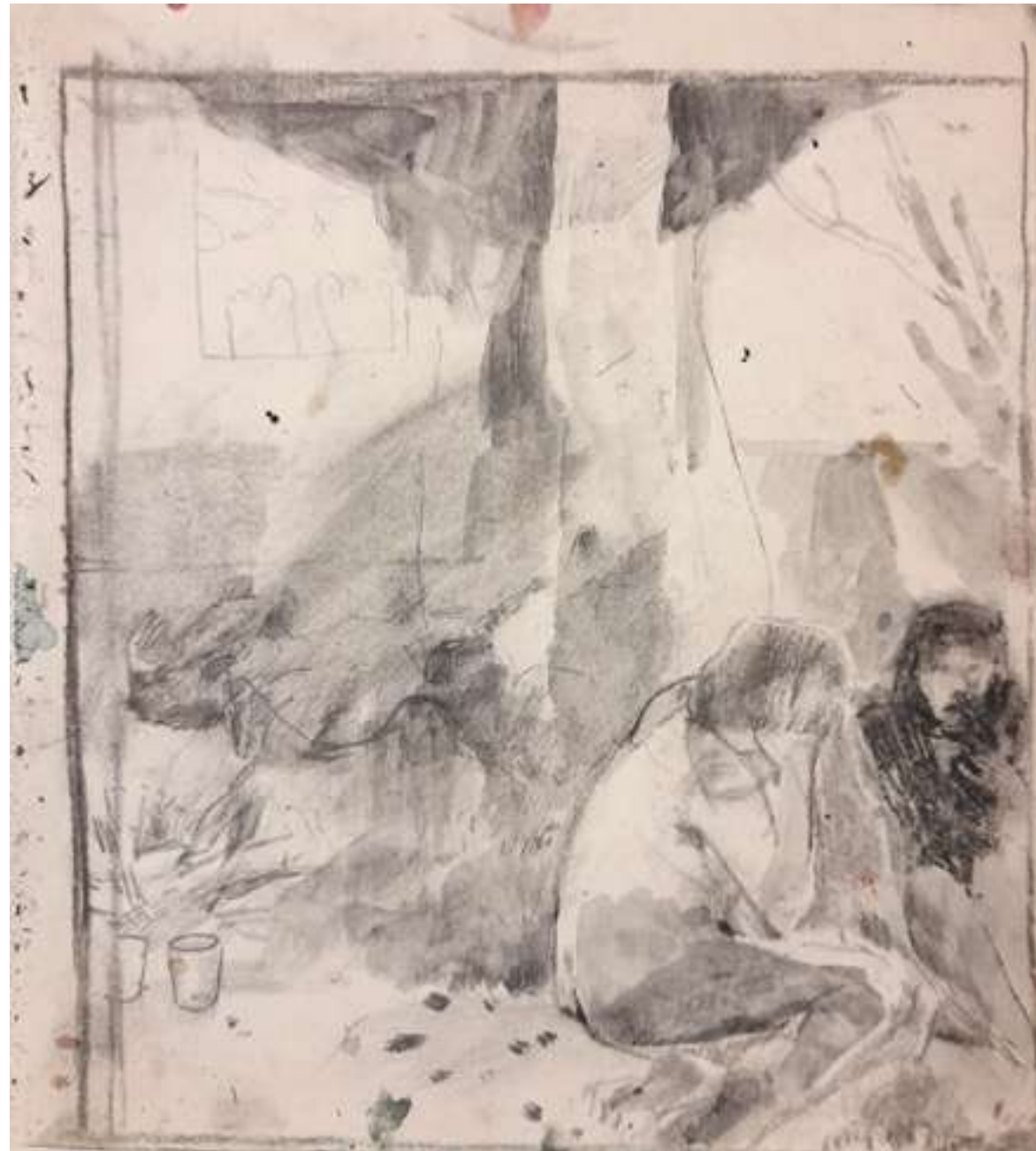
Study 3 Pencil/wash on paper Joana Galego