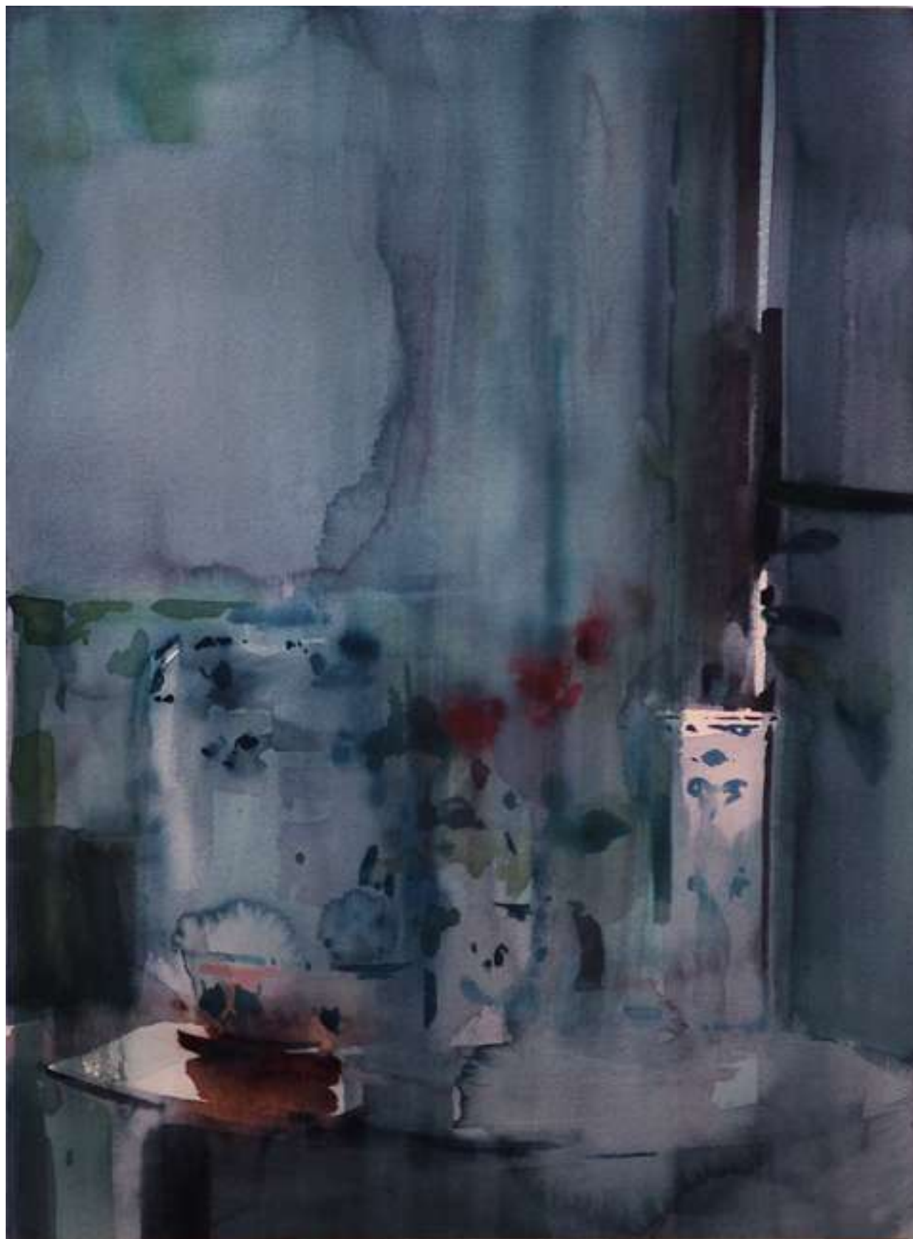
The Dusk Afterwards 2