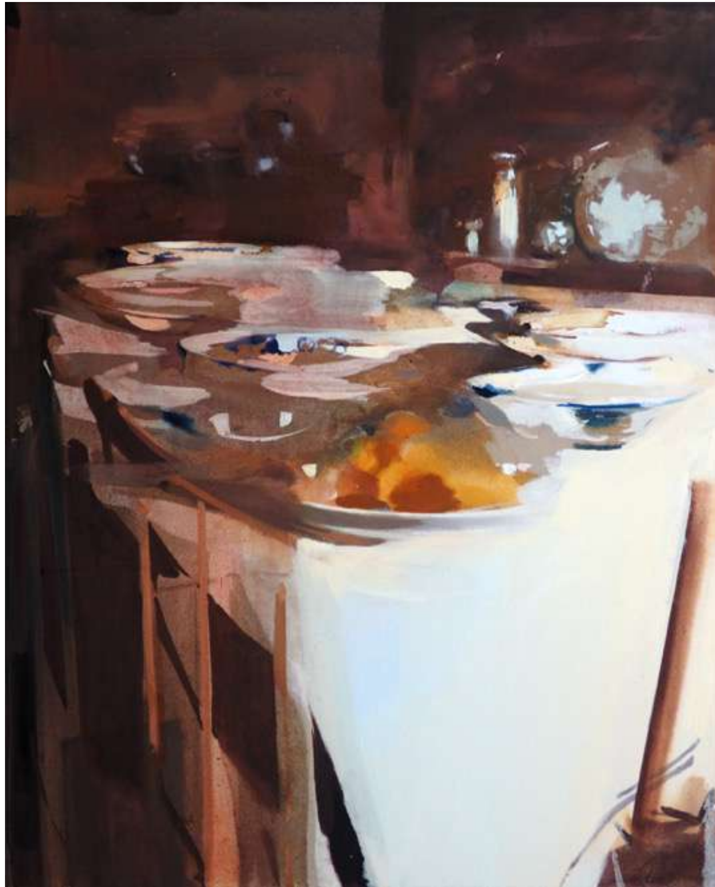
The Doors No Longer Hang True

Eleanor works primarily in paint and print. Her most recent works frame moments of light; passing across objects within the home. Melancholic images are washed in colour and come in and out of focus; creating quiet moments in which to contemplate memory, and longing in image-making.