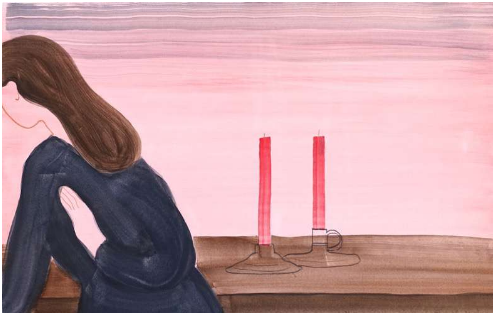
Before the Night Watercolour on paper 34x21cm on Paper Bobbye Fermie