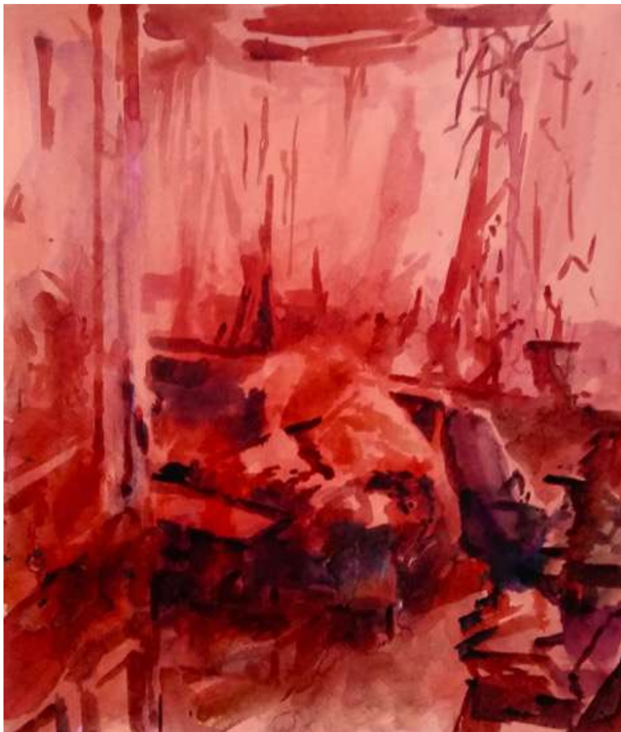
The RedRoom (Study)