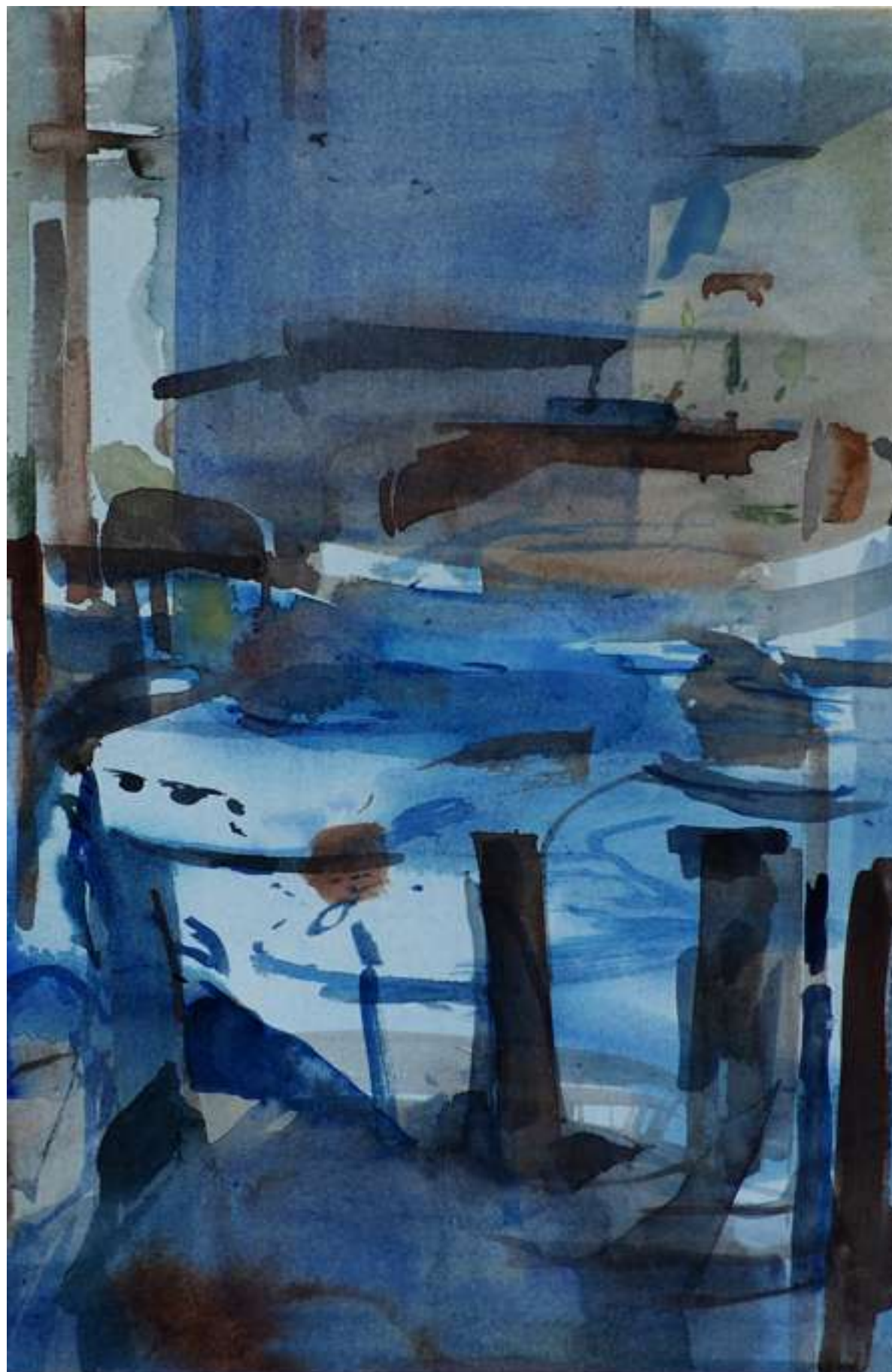
Blue Tablecloth Watercolour on paper 37.5x25cm Eleanor Watson