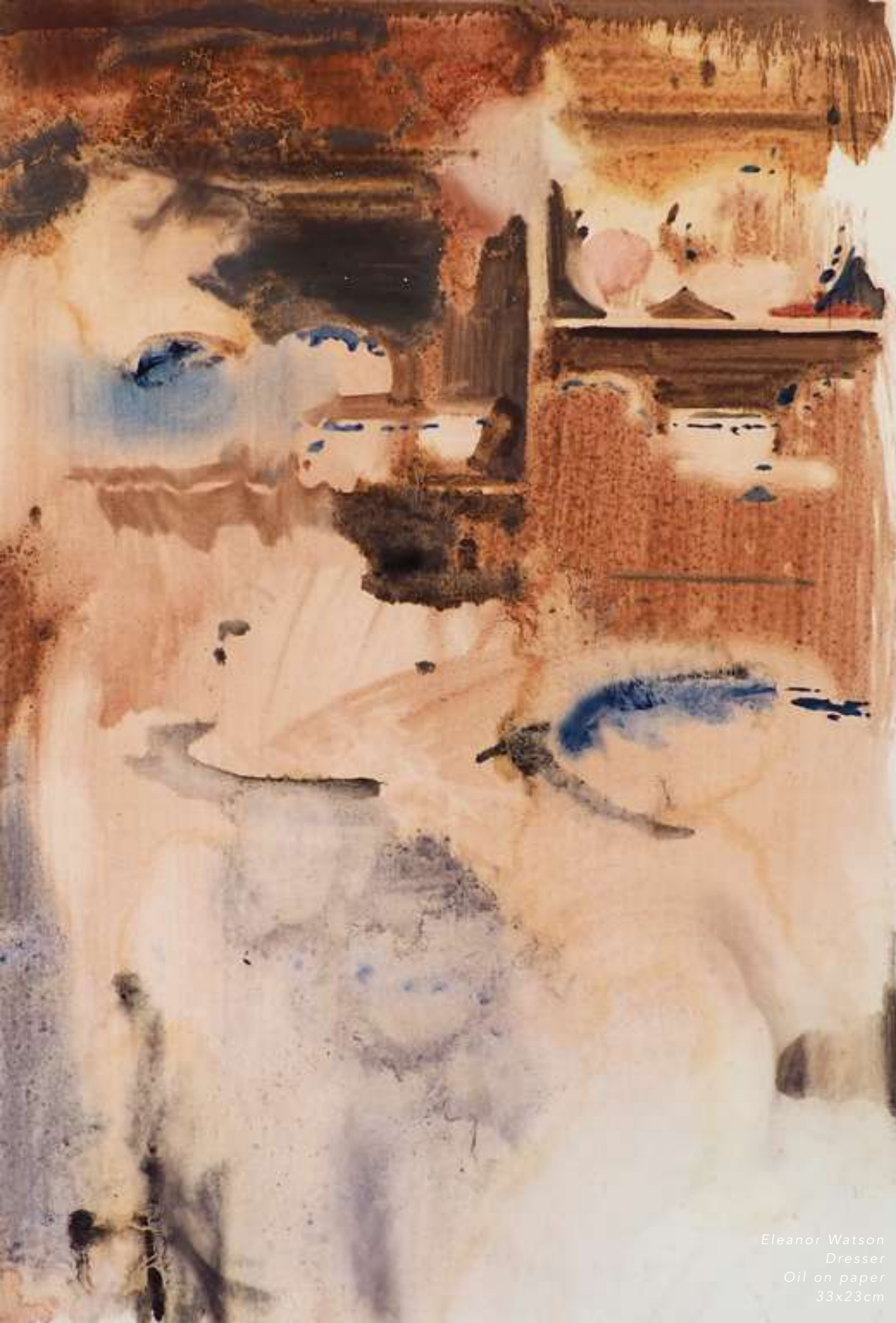
Eleanor Watson Dresser Oil on paper 33x23cm